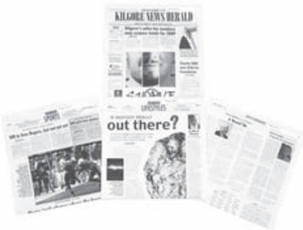
FIRST PLACE, DIVISION 5