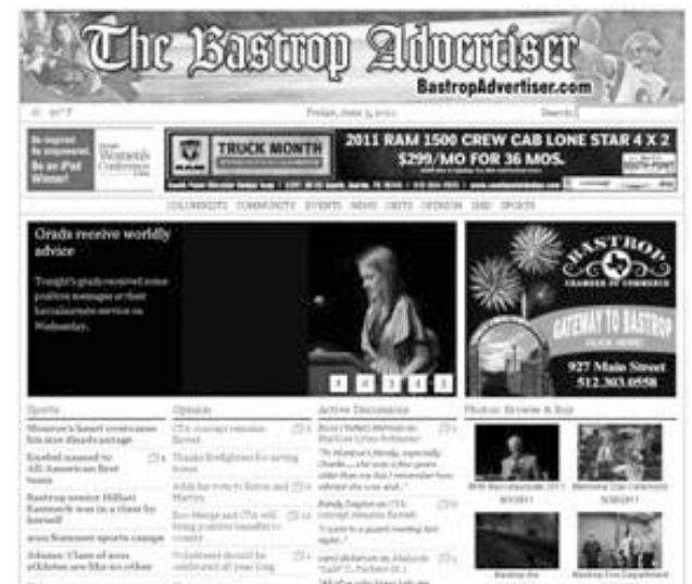
◀ FIRST PLACE, WEEKLY DIVISION A