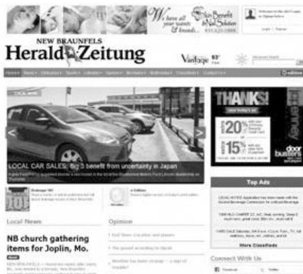
FIRST PLACE, SEMI-WEEKLY DIVISION ▶