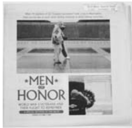
FIRST PLACE, BLUE MOON DAILY