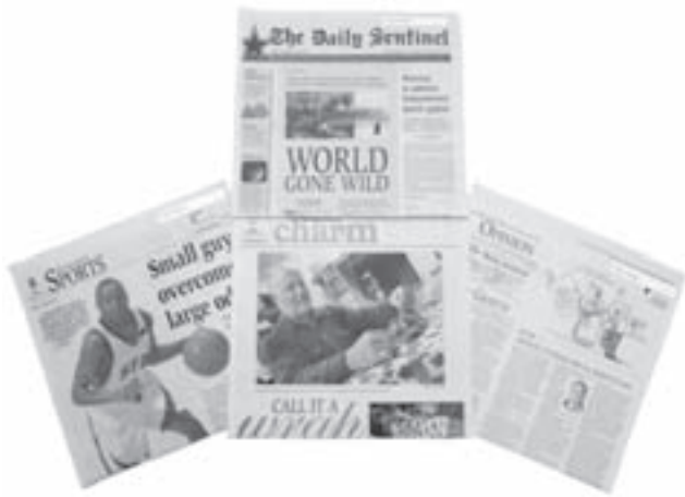
FIRST PLACE, DIVISION 2