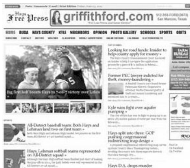
FIRST PLACE, WEEKLY DIVISION B ▶