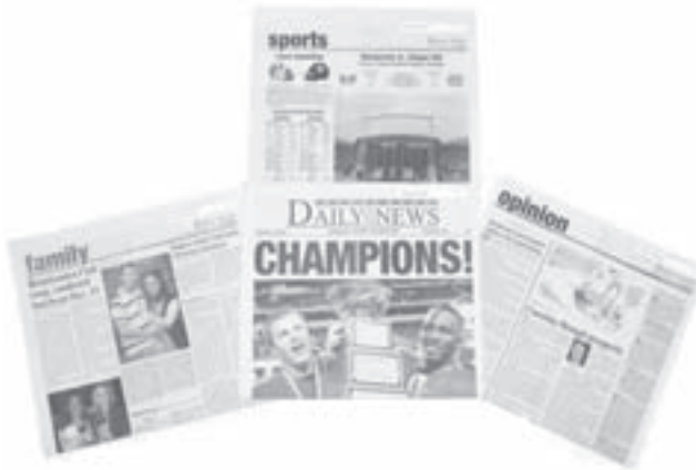
FIRST PLACE, DIVISION 3