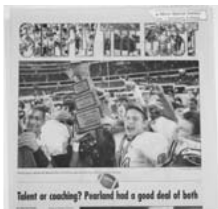
FIRST PLACE, BLUE MOON WEEKLY A