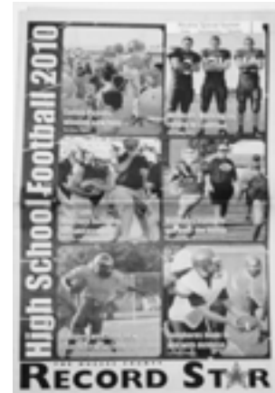
FIRST PLACE, ROUTINE WEEKLY A