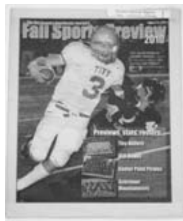
FIRST PLACE, ROUTINE WEEKLY C