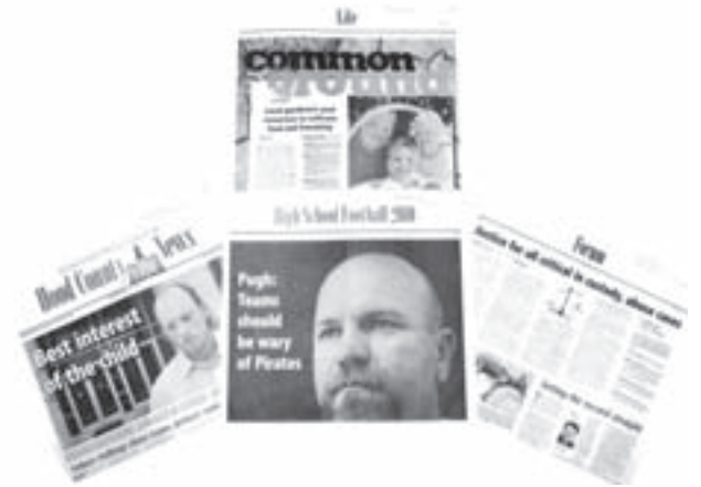
FIRST PLACE, DIVISION 4