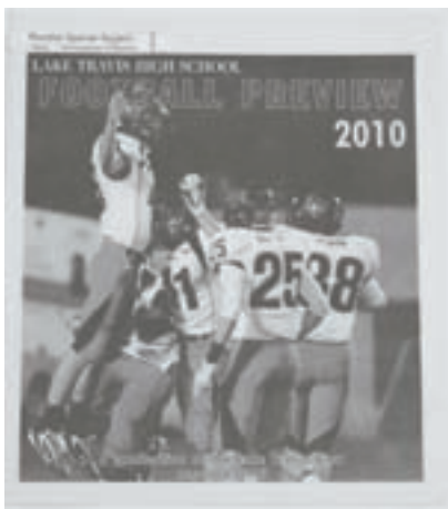
FIRST PLACE, ROUTINE WEEKLY B