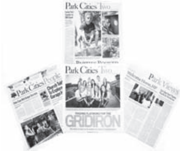
FIRST PLACE, DIVISION 6